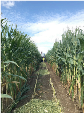
2019 Northern New York Agricultural Development Program corn silage research trial plot at Madrid, NY.