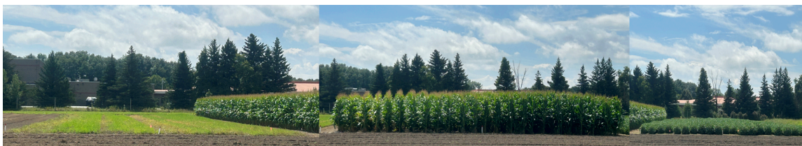
Figure 1: Crop research plots at the Willsboro Research Farm; photo: Joe Lawrence.

Plots were established for each crop under evaluation at two field locations in Northern New York (NNY). Two farms in central Lewis County (western NNY) hosted the project with Karelus Farm hosting the soybean trial and Silvery Falls Farm hosting both corn and alfalfa trial plots. The Cornell Willsboro Research Farm in eastern NNY hosted trials of corn, soybean, and alfalfa.