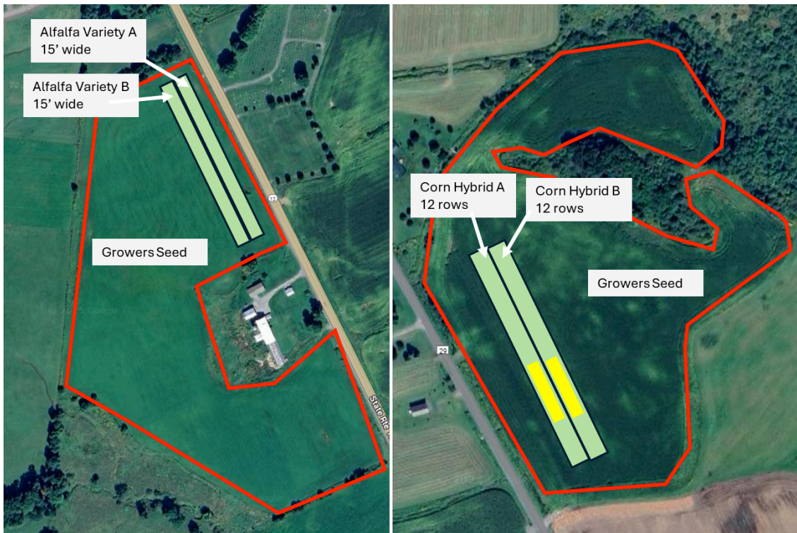
Figure 2: Example of how plots are integrated into the host farms fields, Field Crop Performance Network Development Pilot Project. NNYADP, 2024.

Weather data was collected utilizing on-site observations and the Cornell Northeast Climate Center's gridded weather data (Figure 3, Table 3). Season-long, in-person scouting of the trial locations was performed to monitor crop stage, crop performance, and potential impacting events, such as pest outbreaks.